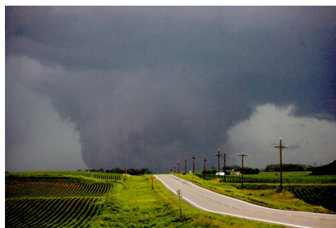
1992 Chandler Tornado