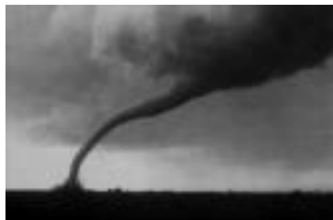
1968 Tracy Tornado